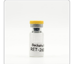
Reta 50mg - RET 260527-01