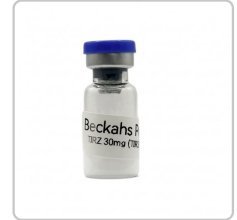
Tirz 30mg - TIR260520-01