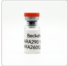
ARA-290 10mg - ARA260520-01